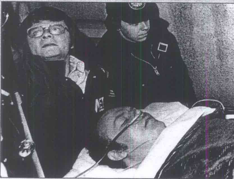
Paramedics and hospital workers rush Larry Flynt to surgery after his transfer from the hospital in Lawrenceville. His condition had worsened in the three days following the shooting.

Last night was the first time I ever watched the news with tears in my eyes. I