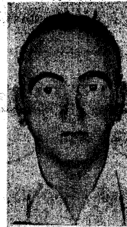
DAVID W. FERRIE Secrets to his grave?