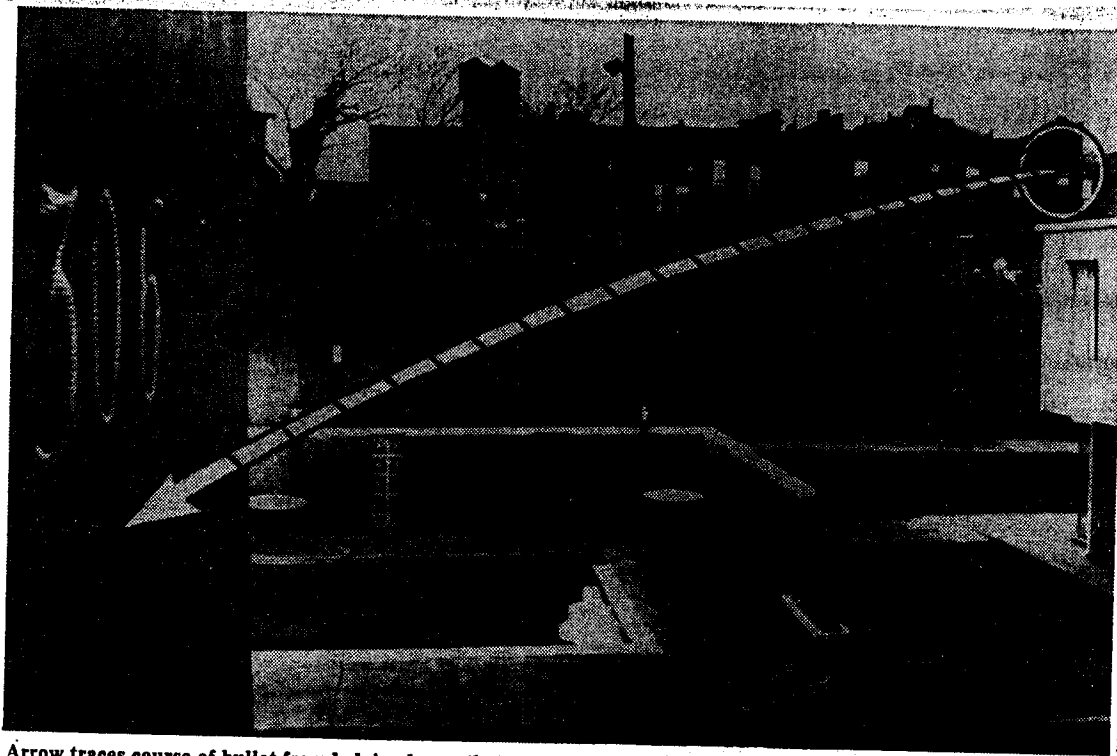
Arrow traces course of bullet from lodging house that assassinated Dr. King.