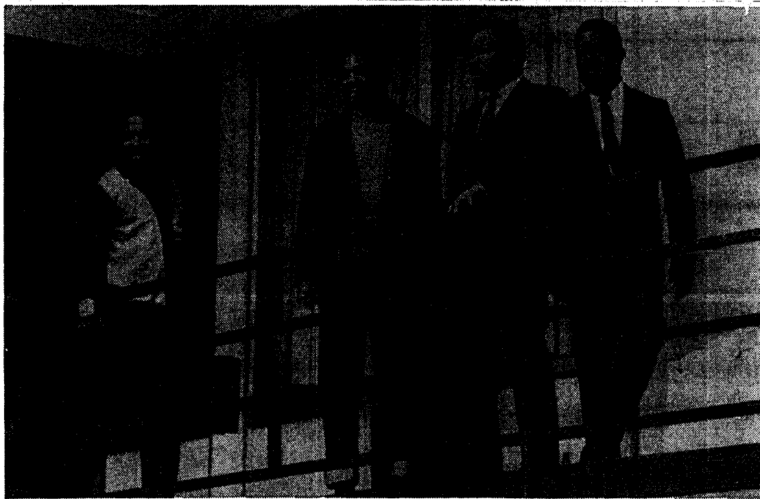
One unanswered question was why Dr. King changed motels in Memphis.