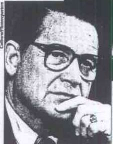
Protest in Moscow last January over Soviet actions in Lithuania. While USSR still must be monitored closely, says CIA Director Webster (l), "the threat... will not be the same again."

invasion had been ill-conceived on almost every level), Dulles soon was relieved of his post. And, in the decades since, the CIA has been regularly rocked by scandal—from the botched attempt to employ the Mafia in the 1960s to assassinate Fidel Castro to its recent murky role in the Iran/Contra affair.