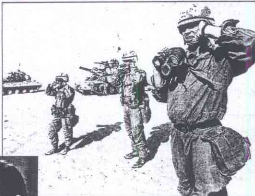
U.S. Airborne rangers in Saudi Arabia, September 1990. CIA reports that Saddam Hussein meant to invade their country after Kuwait were key in persuading the Saudis to allow American troops to set up bases there.

To help identify these priorities in the '90s, Webster has created a new CIA directorate—in addition to the four existing ones for Operations, Intelligence,