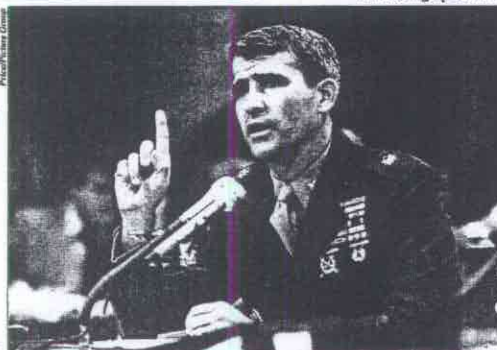
Oliver North testifies at the Iran-Contra hearings, 1987. The late CIA director William Casey was criticized for failing to control North's handling of the arms-to-Iran-for-hostages operation and the pursuit of a secret war in Nicaragua, and for failing to tell Congress.

"We should have had strategic intelligence in place long before," said Senator Boren, who sees a Cold War mindset still in vogue at the agency.