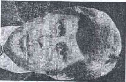
SEN. JOHN V. TUNNEY ... cites computer