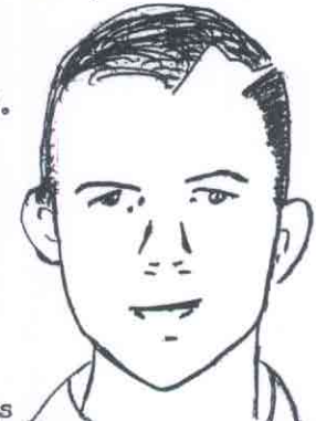
OSWALD - CONTROLLED?

BUT "Mind Control" comes from somewhere - and political assassination has no corner on it. Kenneth Arnold, the famous UFO sighter who allegedly sighted the first modern UFOs in 1947, was personally investigating the June 21, 1947 Maury Island incident of Tacoma, Washington. UFO fragments were involved and eye-witnessed sightings. But all too soon, walls began to have eyes and ears. Strange people began to pop up. UFO fragments were stolen. Arnold was hypnotized to see a fully active-lived-in-room, which turned out to be quite old, and far from recently lived in. And several military Intelligence agents met their death aboard a military plane carrying the 'fragments'. The mysterious Mr. Crisman, who showed all signs of being a under-cover agent (the, then, new C.I.A.?). Ending when Arnold nearly crashed his little plane, for reasons not too mundane. ( The Real UFO Invasion , Ray Palmer, Greenleaf Classics, Inc., 5839 Mission Gorge Rd., San Diego, Calif. 92120).