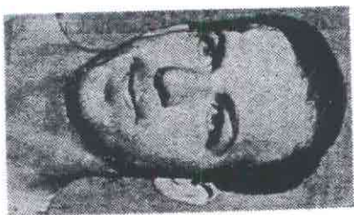
LEE HARVEY OSWALD

Because of his experience as director of the CIA from 1963 to 1961, other commission members turned to Dulles for advice on how to