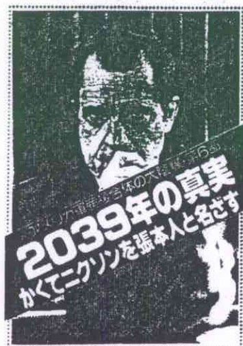
From October 27th issue of Shukan Bunshun.