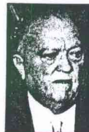
J. Edgar Hoover