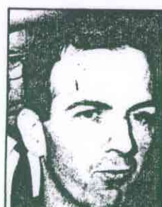
Lee Harvey Oswald

same time, protect myself in more than one way. For instance, I remembered what had happened to Dorothy Kilgallen after she had spoken for half an hour with Jack Ruby, the assassin of