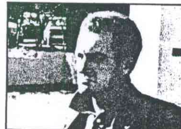
"Frenchie," one of several aliases.