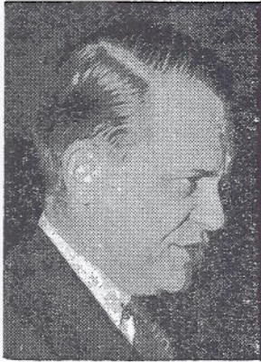
REP. MARTIN DIES