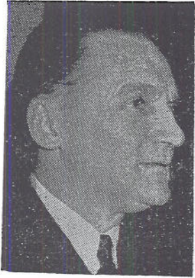
SEN. GERALD P. NYE