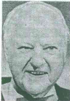
BILLIONAIRE H.L. Hunt