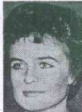
ASSASSIN'S WIFE Marina Oswald