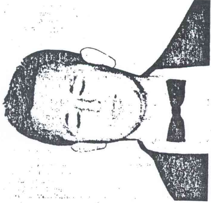
Photograph taken 1968