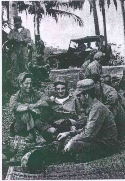
MARINE "OSWALDSKOVICH," RIGHT, IN THE PHILIPPINES (1958)