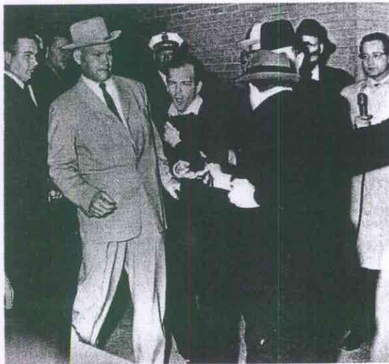
THE ACT THAT INTENSIFIED THE MYSTERY

At about the time of this interchange, Oswald took a break from filling orders at the Book Depository in Dallas, where he had been employed since Oct. 15. He too was gazing out a window at the crowd beginning to mill about in Dealey Plaza. Os-