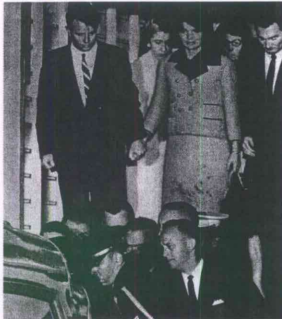
AT ANDREWS AIR FORCE BASE, THE TRIP NO ONE WANTED ENDS

What had been let loose in America? No one was sure. ■