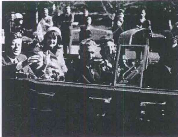
FROM BEHIND, THE TARGET COULD HAVE BEEN KENNEDY OR CONNALLY

"I know what your 'looks' mean," she said. She pleaded with him not to go and at last he agreed. Actually, Nixon was not in town at all and Oswald knew it. He had said "Nixon" because it