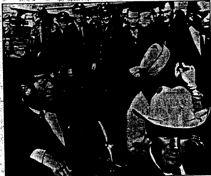
Connally, in right foreground, about to ride into Dallas with President John Kennedy and his wife, Jacqueline Kennedy, on Nov. 22, 1963.

Connally became something of a national celebrity in the aftermath of the assassination. He was overwhelmingly re-elected governor in 1964.