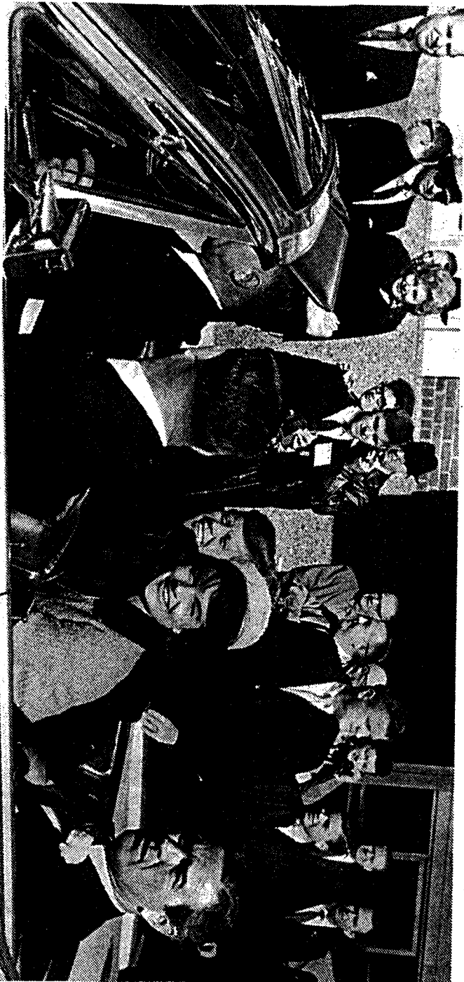
John B. Connally, right, who was then Governor of Texas, sitting with President and Mrs. Kennedy in the limousine in which Kennedy was assassinated on Nov. 22, 1963. Mr. Connally, who later in the motorcade moved to the front seat of the car, was also shot in the attack.