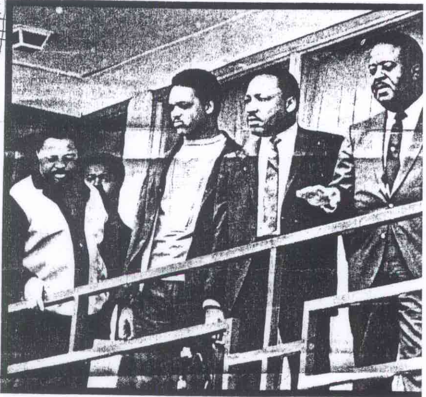
Martin Luther King on the Memphis balcony where he was later shot.

Through the years, Martin Luther King was bombed, beaten and stabbed; over 50 different death threats were recorded. He was always unarmed, without bodyguards, marching on public streets in hot situations, taking on first the Southern power structure and then the North, feared and