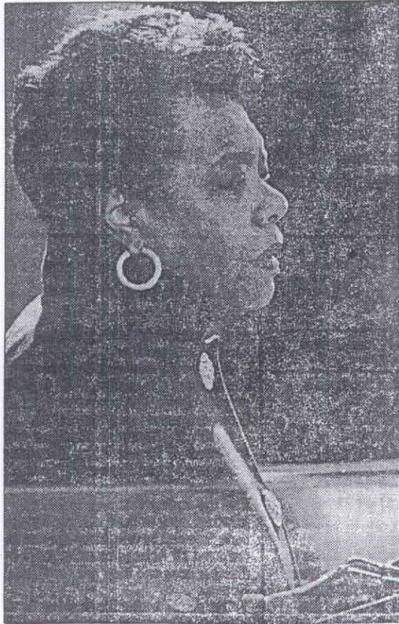
ANGELOU

Women, children, men, Take it into the palms of your hands. Mold it into the shape of your most Private need. Sculpt it into The image of your most public self. Lift up your hearts Each new hour holds new chances For new beginnings. Do not be wedded forever To fear, yoked eternally To brutishness.