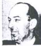
L. J. CONNERY

"An Enlightened and Informed Public Is America's First Line of Defense" — Congressman Connery