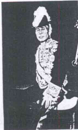
BARON GENERAL GIICHI TANAKA and his entire cabinet drew up the infamous Tanaka Memorial—Japan's Mein Kampf —when he was Premier in 1927. Since then, the rulers of Japan have followed his plan to the very letter.