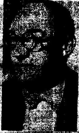
JOSEPH ALSOP He says the atom shelters