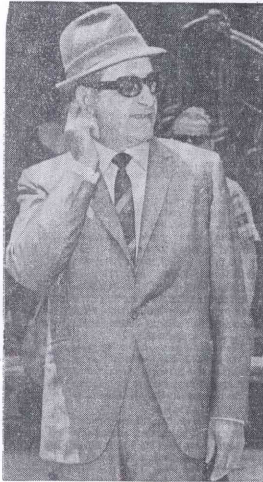
Chicago Daily News

None of the extraordinary possibilities that have sur