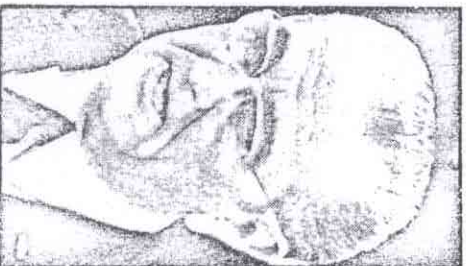
JOHNSON refused to spill any details.

'Kennedy Was Trying To Get Castro, But Castro Got To Him First' —LBJ