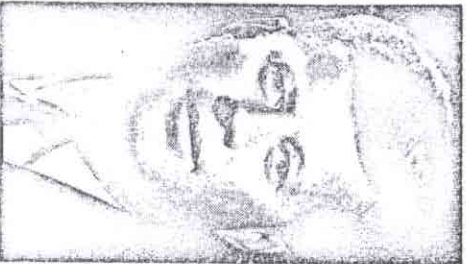
CIA blamed Kennedy for Bay Of Pigs failure.

Oswald was just the chump set up to take the blame, while the real killers escaped. According to Morrow, Oswald was a small-time CIA em-