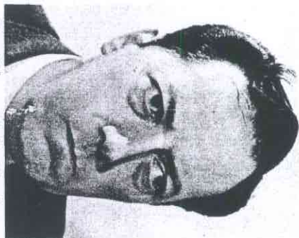
New Orleans DA Jim Garrison: He reopened conspiracy case.