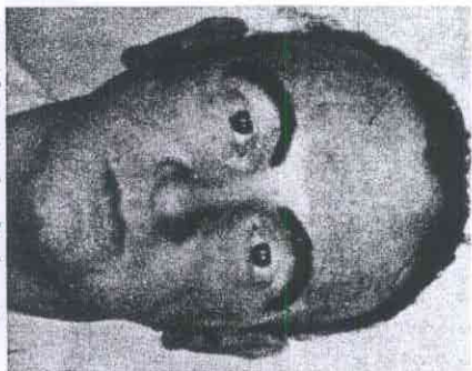
David Ferrie; he died as Garrison planned to arrest him.