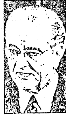
JOHNSON refused to spill any details.

'Kennedy Was Trying To Get Castro, But Castro Got To Him First' —LBJ