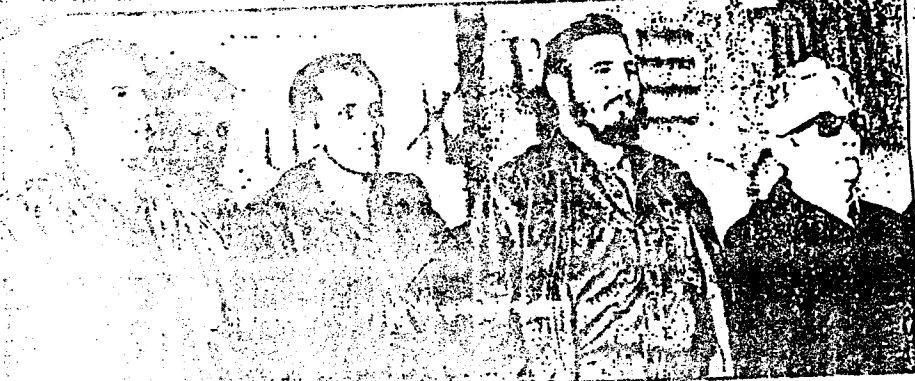
...CIA... Kennedy... Bay of Pigs... failure...

They didn't even was the CIA; hitting the American presid. That was why the t Warren Commission fear of what they me.