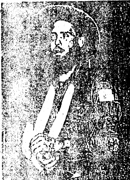
ROLANDO CUBELA , almost a Castro lookalike with the beard and glasses, wore his arm in a sling as a result of wounds he received in the Presidential Palace takeover in Havana on Castro's behalf.

Kennedy Was Trying to Get Castro, But Castro Got To Morrow