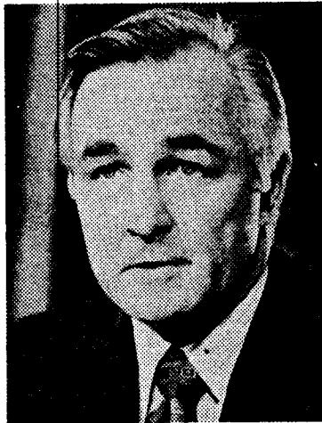
STANSFIELD TURNER ...cites effect on CIA sources