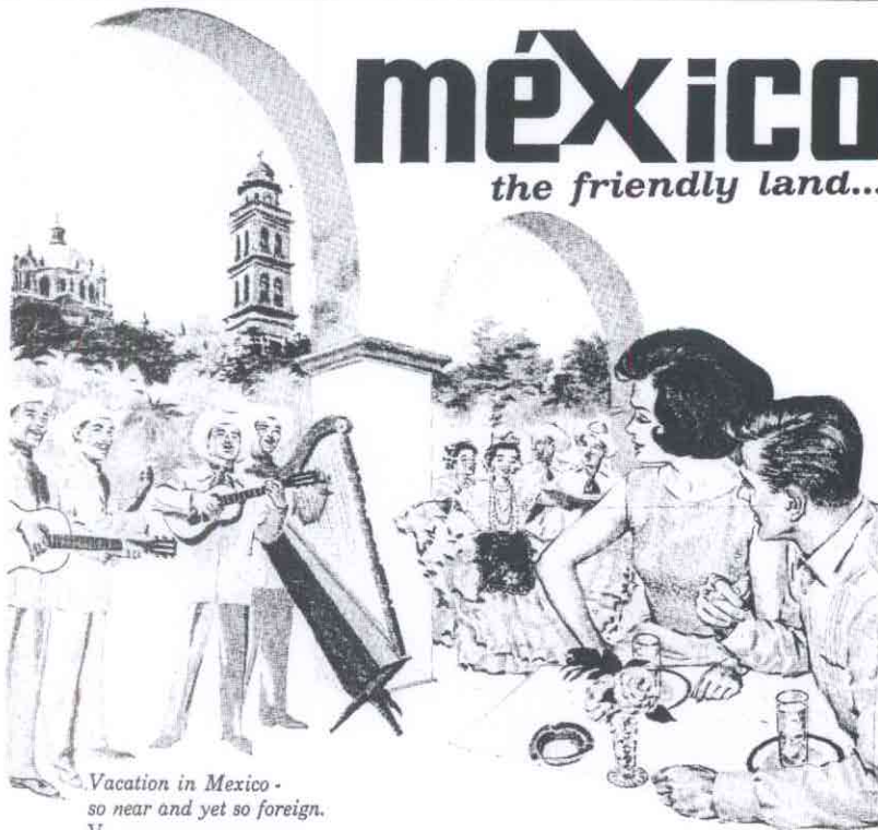
Vacation in Mexico - so near and yet so foreign. Veracruz is for fun and gaiety.

So everybody went back to Miami? Yeah, we get back to Miami, go to the recruiting station—that's where they'd been sending our checks, dig—pick those up, and go our separate ways. Very sad scene at the recruiting place because they've got the lists of guys that got wiped or captured, and relatives and so on are falling by to look at the lists. And we talked to a couple of guys who got away—swam out and got picked up by boats. What did they have to say about the invasion? What did they say? "We got wiped, man... wiped." #