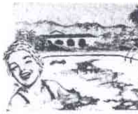
Fortín de las Flores, Veracruz.

Such contrasts make Mexico unique - an incomparable vacationland