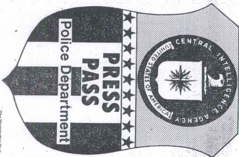
The Washington Post