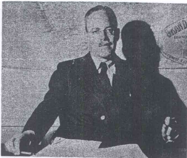
Allen Welsh Dulles, controversial OSS "master spy" in neutral Switzerland later director of the CIA. His wartime network stretched throughout Europe and into the heart of Hitler's Third Reich.

fluke. It's not really a function that they're oriented toward conducting, and it's something I think they'd just as soon get rid of.