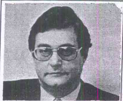
(Victor Marchetti has been in U.S. intelligence activities for almost 20 years, 14 years of that time being with the CIA, the last three years of which he was a staff assistant to Richard Helms. He is the author of "The CIA and the Cult of Intelligence" and "The Rope Dancer.")