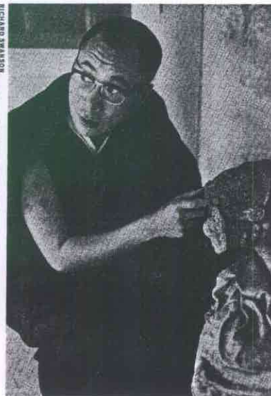
DALAI LAMA IN EXILE IN INDIA (1968)