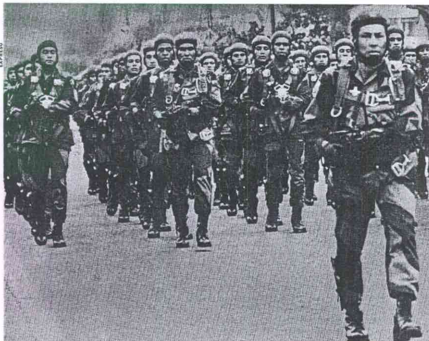
PERUVIAN TROOPS SPECIALLY TRAINED TO FIGHT GUERRILLAS (1965) Illuminating the dilemma of secrecy in an open society.