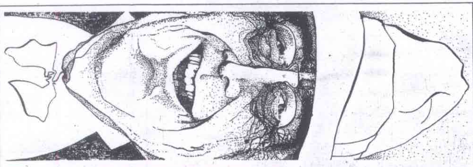
His view of Franklin D. Roosevelt.