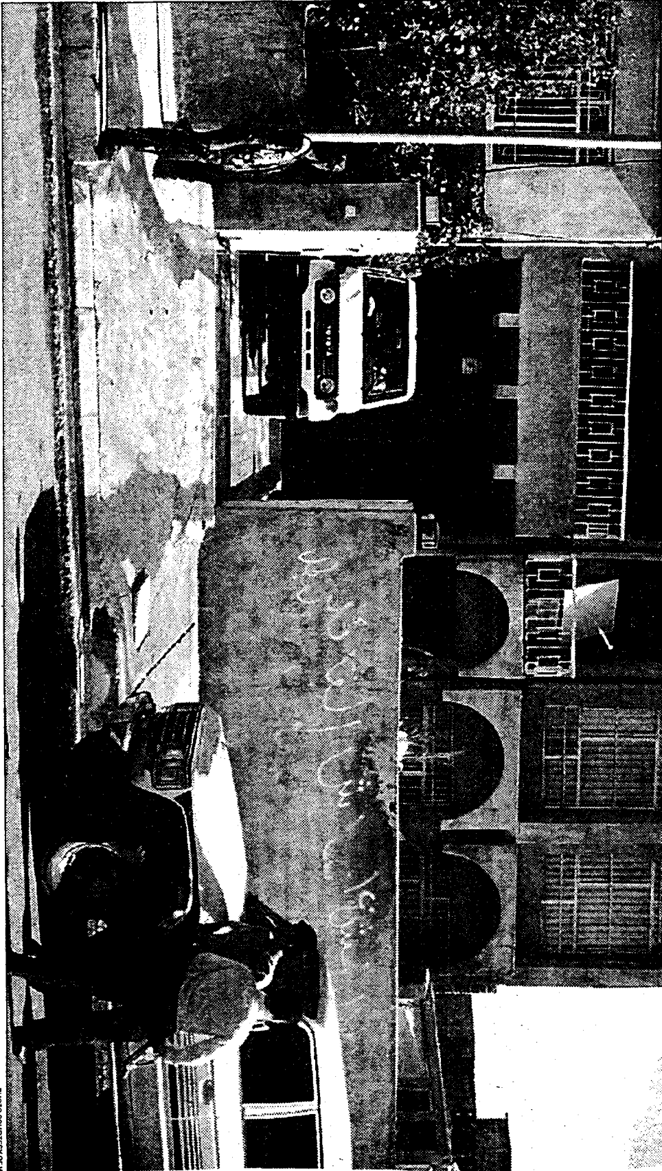
The American residence located in Salahuddin, northern Iraq, a site of activities involving CIA agents and Kurdish guerrillas aimed at overthrowing the regime of Iraqi President Saddam Hussein.