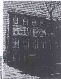
INPOLSE vanished from this Washington townhouse, 10 blocks from the White House.