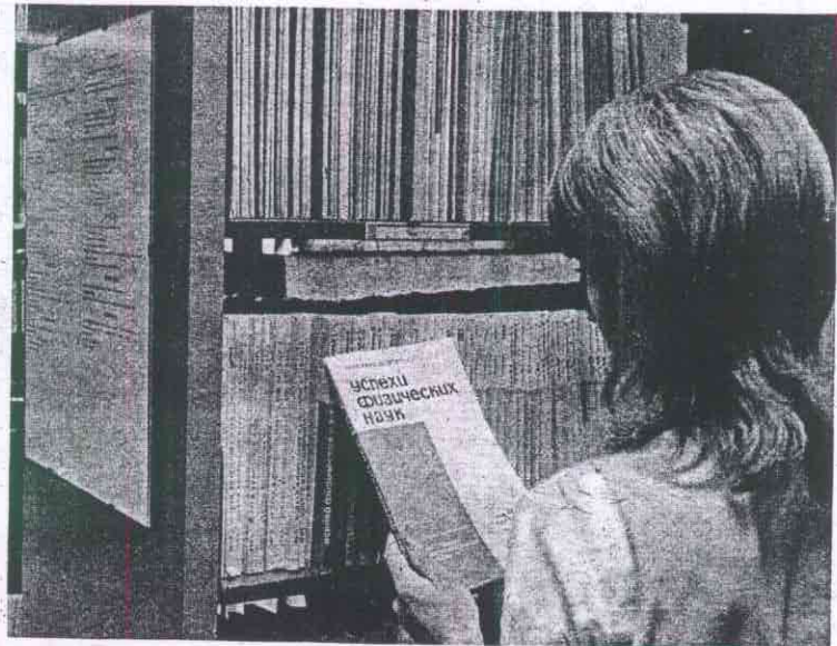
A staff member selects a Russian book for study. The head of the Soviet Internal Affairs branch is a woman, who requested Parade's reporter not reveal her name.