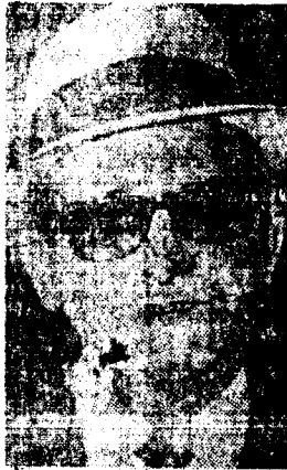
SAM GIANCANA A gangster chieftain