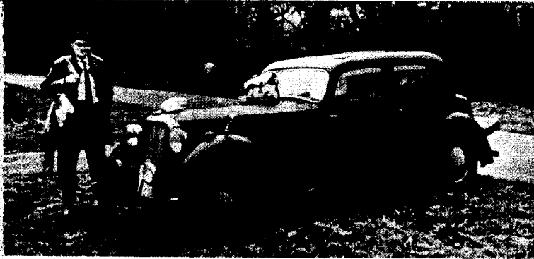
ANGLETON ON A FISHING TRIP TO ENGLAND (1964) At home with Dante, poker and handicapping horses.

profound abhorrence of totalitarianism. Says Angleton: "If one has lived much of his life abroad, as I have, one is apt to judge his country more precious than do those who know no other country well." He recalls the day in 1936, when he was 18 and working through a summer holiday as an apprentice mechanic in National Cash Register's Paris factory, that the workers heard about the Wehrmacht reoccupation of the Rhineland. Says Angleton: "The workers to a man threw down their tools and standing at attention sang the Marseillaise . Then they streamed into the street, cursing the government. I stayed up all night, listening to the furious talk of the workers in the bistros. It was my first political experience—an experience in despair. And the war lengthened the experience. While gathering evidence for the Nuremberg war trials, I came upon the horrifying proof of the extermination of 6 million Jews. To prevent war, to preserve freedom are continuing causes with me. They have shaped my life."