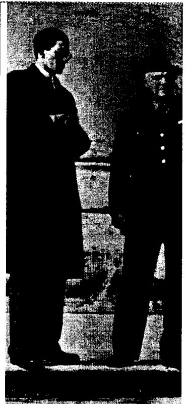
WITH GENERAL DONOVAN AT VATICAN (1946)

Many of Angleton's covert operations after he joined the CIA remain secret. The only people who know what he really did are his superiors and those who worked with him. One exploit that can be told came early in 1956. In collaboration with a friendly intelligence service, his unit acquired a copy of Nikita Khrushchev's famed denunciation of Stalin to the 20th Party Congress. Angleton and his lieutenants also developed the evidence that helped lead the FBI in 1957 to the KGB agent Colonel Rudolf Abel, who had operated since 1948 from an obscure photographer's shop in Brooklyn. The numbers of spies who have been caught in Angleton's net run into the dozens. They include George Blake, a senior officer in the British Se-