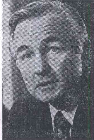
STANSFIELD TURNER ... They are nothing ...

"It's a meeting and [Turner and Christopher] are talking and the president asked a question to Christopher and then to Turner," the firm said. "They say nothing about the president. They are talking to the president about a problem."