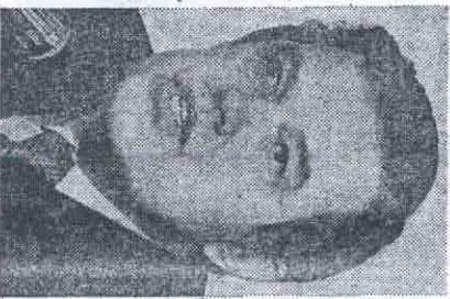
SEN. FRANK CHURCH ... will air charges

White House officials declined to discuss what sort of briefing was provided the President as the basis for his charge of an effort by the Allende government to destroy opposition press and parties. It was this charge upon which Mr. Ford based his justification