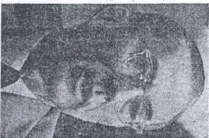
WILLIAM E. COLBY ... testimony causes stir