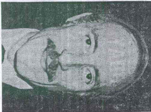
ORLANDO LETELIER ... assassinated by Chilean agents