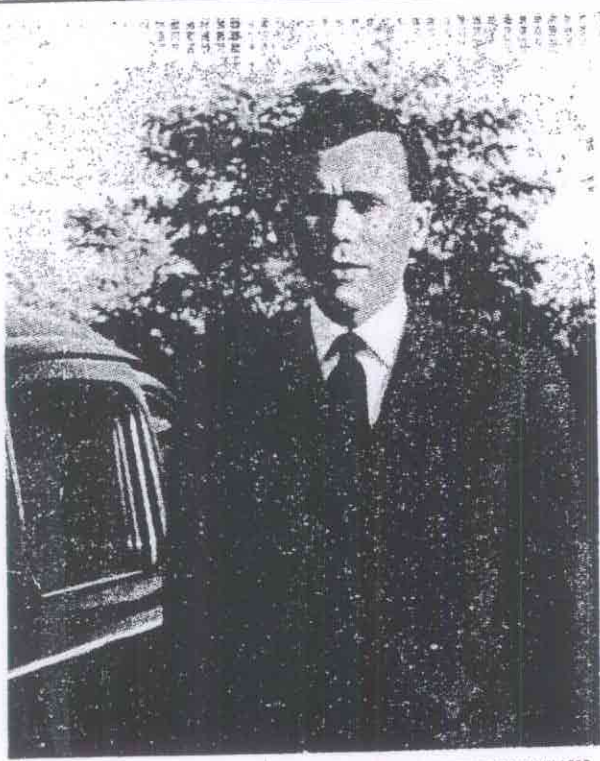
A PHOTO FROM "MOLEHUNT," TAKEN IN BERLIN IN 1953