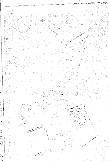
WARREN REPORT STACKS HIGH Shown with critical boots