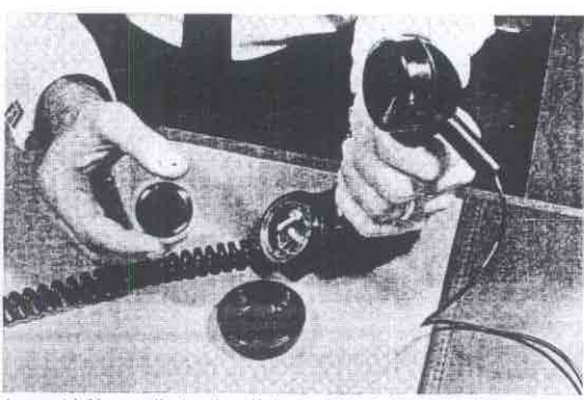
An expert holds a small microphone that can be hidden behind a telephone mouth piece.

tion is being taped. If fact, Americans are so busy snooping on one another that it has almost been forgotten that Big Brother may not be an American at all. A European diplomat recently told of having discovered a man tinkering with the wall clock in his Foreign Office chamber at home; he immediately called his security men for fear the man was planting a microphone, "for our Russian friends." A short time later, an American who works for ghe American military in Washington made an unexpected Saturday visit to his office and found a stranger in the process of dismantling his phone. The stranger shad tools draped around his waist and said he was a telephone man checking phones. The American said later that he assumed a microphone was being planted. Asked, who he thought responsible, he said, 'Oh, I suppose one of our spooks'— eaning a rival American military agency, id it occur to him, as it had to the uropean, that the man could have been ne of our Russian friends'? The therican thought about that for a mont. "Well, of course, it could have "" "but I'm told our "" but I'm told our "" but I'm told our "" but I'm told our "" but I'm told our "" but I'm told our