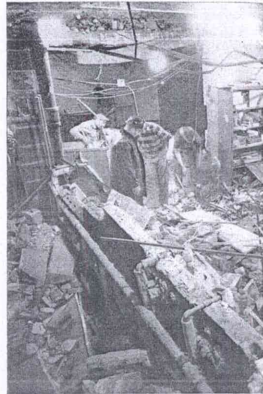
IBM OFFICES IN

U.S. agriculture is still one of the world's wonders—and its economics is still a mess. Amid spectacular farm production and surpluses, some 15 million Americans go underfed. Last week, in an attempt to drive the price of prize Idaho potatoes up from about $2.50 a hundredweight to $3.50, farmers burned 5,000,000 lbs. of them in eastern Idaho in giant bonfires fueled by straw and kerosene. If the price does not rise promptly, say the farmers, they will destroy another 5,000,000 lbs.