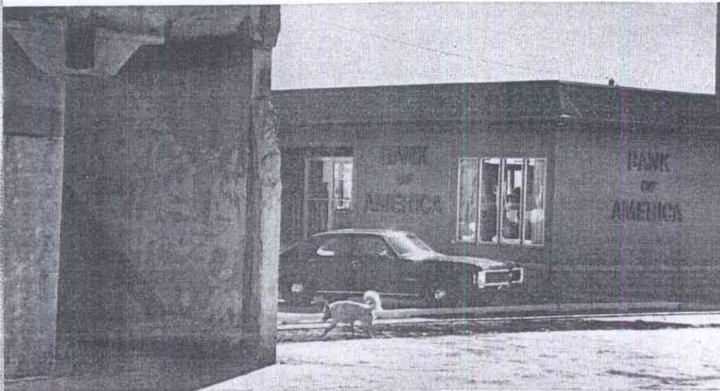
NEW BANK BESIDE RUINS OF THE OLD Growing grimmer in the confrontation.

Corrupt and Doomed. Taking their cue from right-wing racists who used to keep blacks down with TNT, whites and blacks of the lunatic left have begun using explosives to produce sound effects and shock waves in their campaign to unnerve a society that they regard as corrupt and doomed. Schools, department stores, office buildings, police stations, military facilities, private homes—all have become targets. So far, miraculously, fatalities have been relatively few. One small slip, however—or one bloodthirsty bomber—could run up a death toll that could easily rival a week's total in Viet Nam. If the bomb threat continues, that is almost certain to occur.