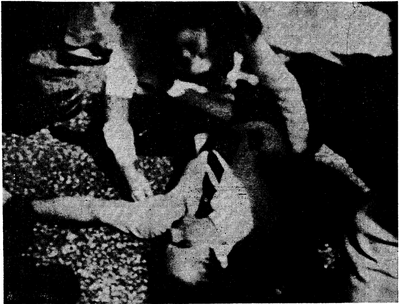
Mrs. George Wallace rushes to her husband's side seconds after he was shot.