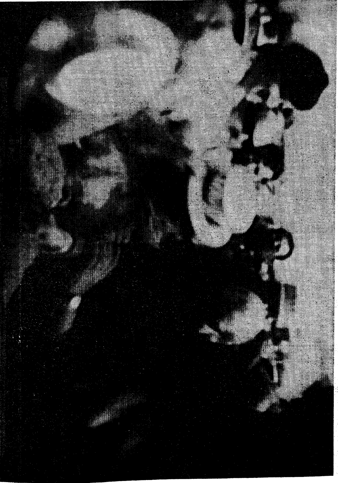
The gunman (dark glasses) fires at Gov. Wallace (out of view in foreground) at point-blank range.