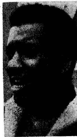
FRED HAMPTON ... slain Panther leader