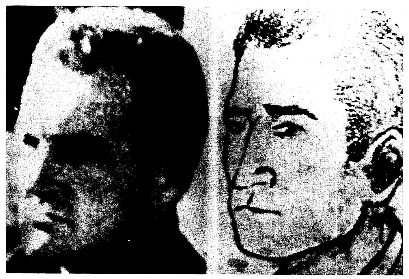
Figure 1. On the left, the tramp photograph of "Frenchy". The police sketch of "Raoul" is on the right.

should be noted that at the time of the shooting Bowers saw two men behind the fence on the knoll, and he also saw "a flash of light or something" coming from that area as the shots were fired.