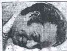
AGNA HASAN ABEDI

BCCI is founded in Luxembourg by a group of Pakistani bankers led by Agna Hasan Abedi.