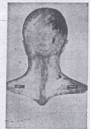
Exhibit 386 shows the "corrected" loca-tion of bullet wound.