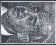
Coroner Cyril Wecht says missing autopsy photos would prove JFK was killed by more than one gunman - just as GLOBE's analysis of the Zapruder film revealed