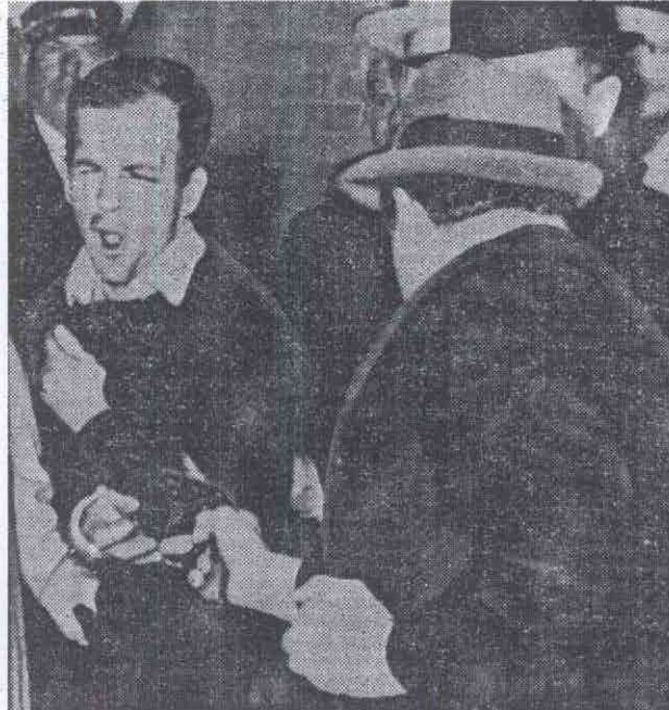
OSWALD GUNNED DOWN BY RUBY

"I guess I have a feeling of frustration after so many years. I feel outraged that we have not discovered the truth when I think that the American public needs to know the