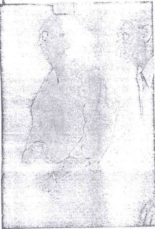
BYRON DE LA BECKWITH is handcuffed as he enters a Criminal District Courtroom Thursday in the custody of a deputy sheriff.