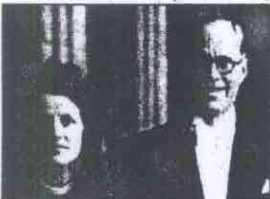
Joseph and Rose Kennedy bought the house in 1933 for $120,000

John F. Kennedy used the house as his winter home and selected his cabinet while staying there after he was elected.